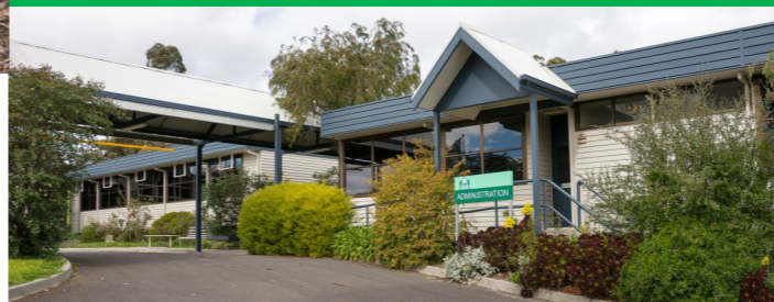
Secondary SORRENTO CAMPUS 30-40 Sorrento Street Broadmeadows