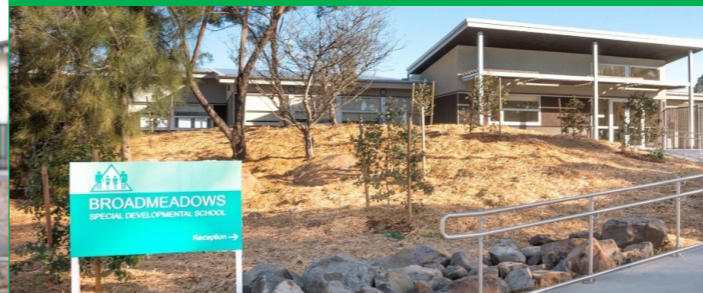
Primary DIMBOOLA CAMPUS 29-35 Dimboola Road Broadmeadows

Therapists see each class several times a week so your child will have regular contact with Speech Pathologists and Occupational Therapists (and Physiotherapists if required).